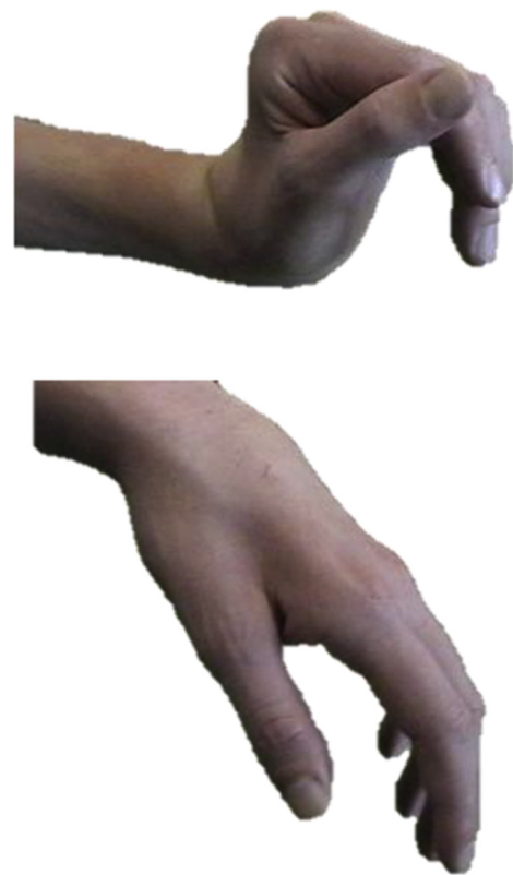
Fig 1 Passive tenodesis.

Essentially, tendon transfer surgery is suitable for people who have sufficient strength in their proximal upper limb to lift their hand to their mouth. This is generally those with C5–8 SCI. Individuals at these levels lack active elbow extension (C5–6), wrist extension (C5), finger and thumb flexion (C5–7), finger and thumb extension (C–6), and thumb opposition (C8). Although not all of the complex movements of the nonimpaired hand can be recreated, basic pinch and grip are possible and can significantly